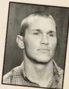
RANDY ORTON (ED FREEL) WWE Superstar on the top-ranked cable TV show, Monday Night Raw, since 2002