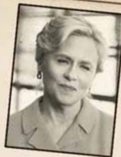
AMY MADIGAN (PRINCIPAL KELNER) Pollock, Field of Dreams, Uncle Buck, Carnivàle, With Friends Like These