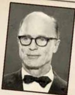
Academy-Award® Nominee ED HARRIS (MR. SIMON) Pollock, A Beautiful Mind, Apollo 13, The Truman Show, The Abyss, The Rock