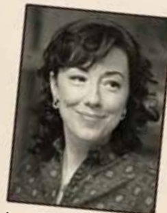
MOLLY PARKER (SHERRI) Deadwood, Swingtown, Six Feet Under, Hollywoodland