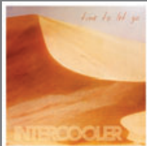
INTERCOOLER TIME TO LET GO SHOCK / ALTERNATIVE