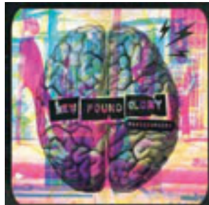
NEW FOUND GLORY RADIOSURGERY REVOLUTION HQ / PUNK