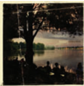
TRANSIT LISTEN & FORGIVE RISE / PUNK