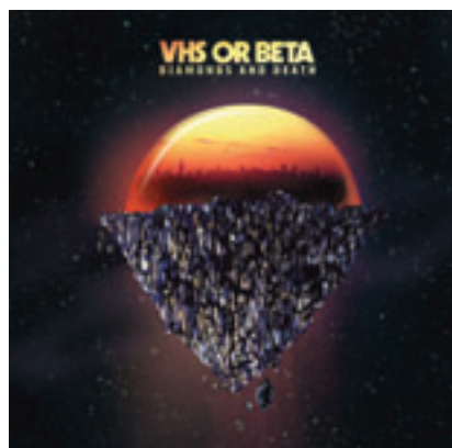
VHS OR BETA DIAMONDS AND DEATH SHOCK / ALTERNATIVE