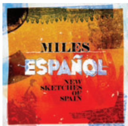
VARIOUS ARTISTS MILES ESPAÑOL-NEW SKETCHES OF SPAIN KOCH / ROOTS/RETRO